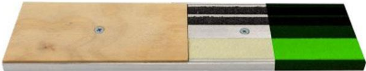
Base & Wood (for use during construction)

ORDER STAIR NOSINGS FOR NEW CONSTRUCTION WELL IN ADVANCE OF EXPECTED INSTALLATION DATE AND BEFORE THE CONCRETE POUR FOR THE STAIRS WHERE THESE NOSINGS WILL BE USED. THIS IS A LONG LEAD TIME PRODUCT.